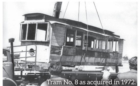
Tram No. 8 as acquired in 1972.

Tram No. 8 is the only tram to carry the number 8 for the Bendigo Tramways from 1903 to present.